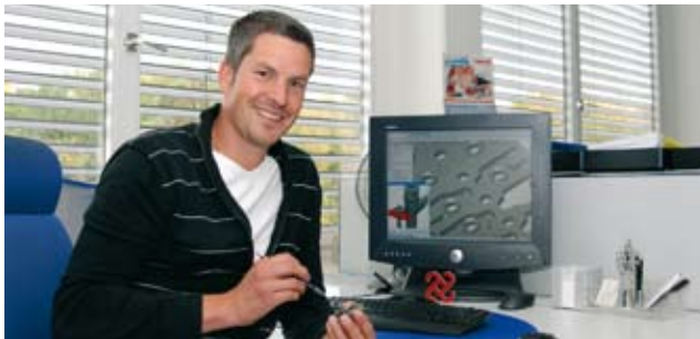
Consulting and engineering are our strengths