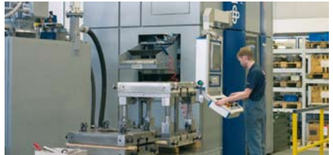
We can help you with your production bottlenecks