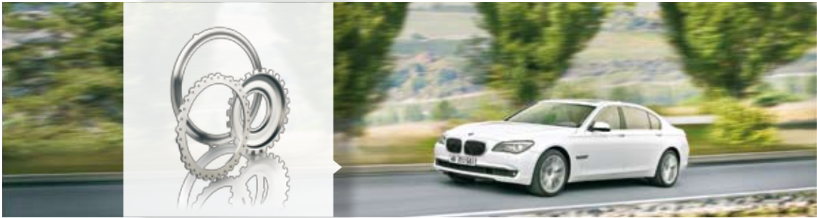
Transmission components: Fineblanking precision at the heart of every automatic transmission

As a global technology and market leader, Feintool supplies total solutions comprising presses, tools and peripheral systems for fineblanking and forming technology. Feintool's activities focus on customer-specific development and production as well as comprehensive support comprising advisory services, engineering and training.