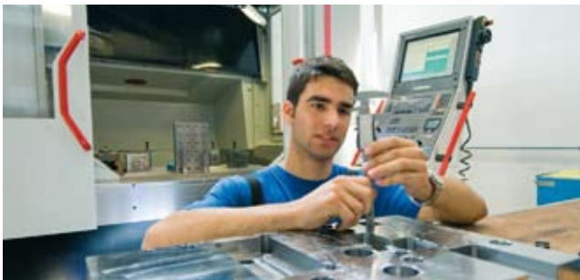
Optimized tool solutions from Feintool