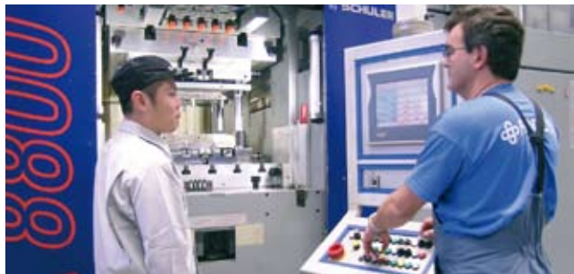
Tested, process-capable tools