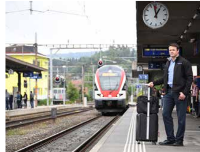
On-site training at your request.