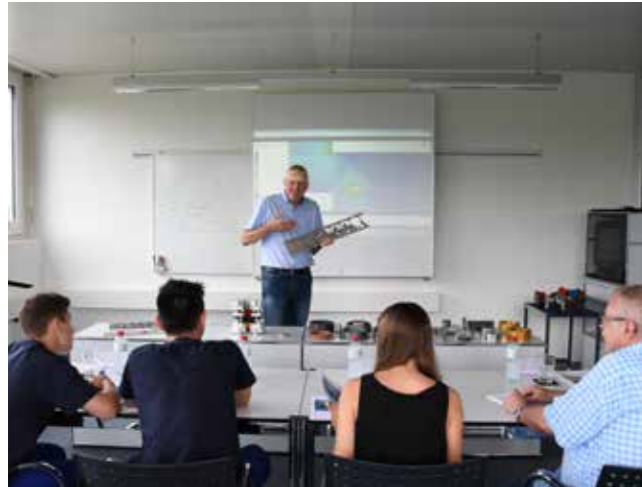
Small training groups for effective learning.

Feintool – the ideal partner for knowledge transfer