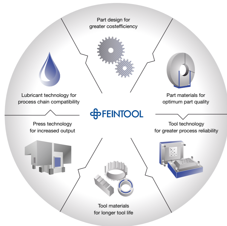
Feintool technological knowledge for every segment.

For reliable processes and high productivity